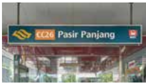
Excellent accessibility Minutes' walk to Pasir Panjang MRT