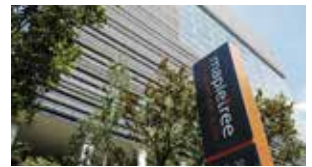
Close proximity to business hubs 4 minutes' drive to Mapletree Business City 6 minutes' drive to Science Park II 6 minutes' drive to one-north