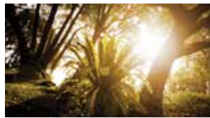
Nestled within nature Private access to Kent Ridge Park