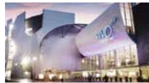
Lifestyle amenities Minutes' drive to shopping, dining and entertainment